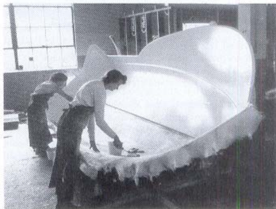
Women workers apply fiberglass cloth to Lake 'N Sea boat at the Michigan Fiberglass Plastics plant in Holland, Michigan, circa 1961.

By January of 1958, Motor Boating magazine featured