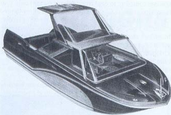
The Grand Traverse Cruiser slept two in a cabin with cushioned berths, galley, toilet, and large storage spaces. The ventilating cabin and bridge windshields and canopy top were standard equipment.

new boat after construction. Delamination, or the peeling of fiberglass away from its wooden supports, transom, or floor, would occur when moisture was introduced naturally between the wood and the fiberglass. This not only looked bad to the customer, but also because it would more than likely undermine the strength of the boat. Soon the name "Leak 'n Sink" became synonymous with this boat model as it was gladly sold to another Michigan manufacturer in 1958 with less than 300 boats produced.