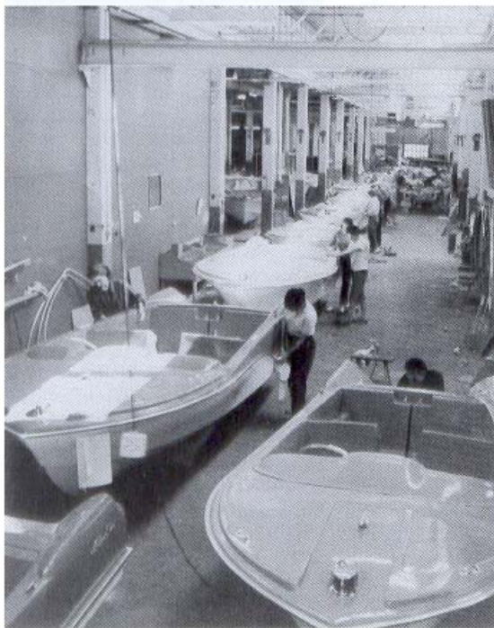
Lake 'N Sea boats receive trim and hardware at the Michigan Fiberglass Plastics plant.